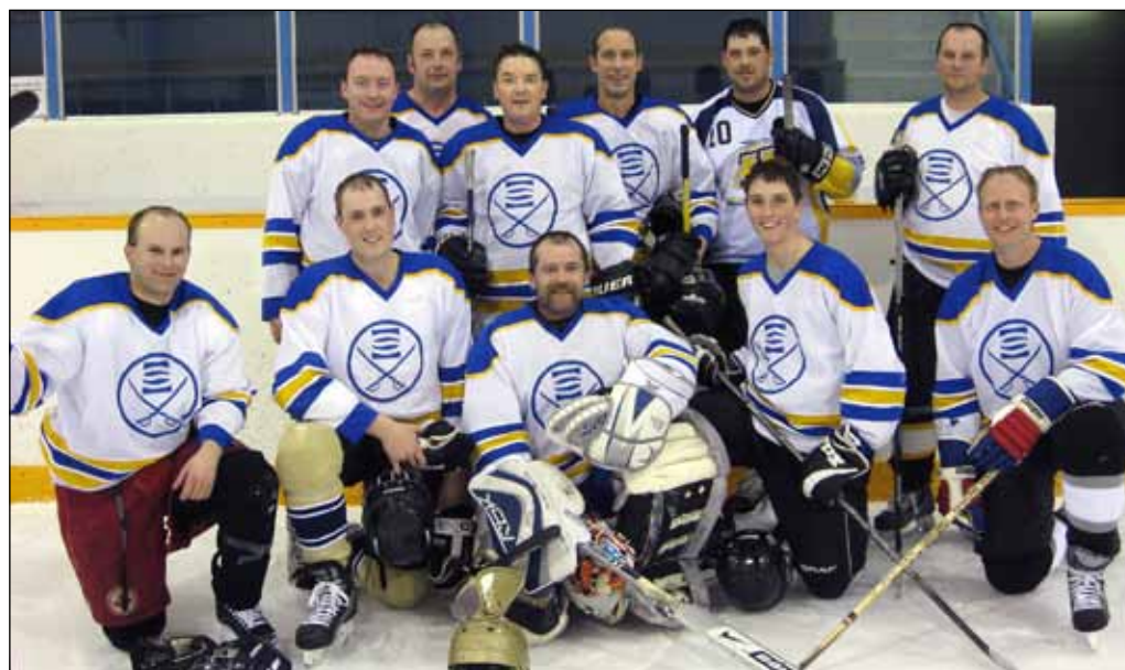
The Calgary office staff, including senior execs, joins the field staff for a hockey tournament in Stettler.

"We have a healthy capital budget and lots